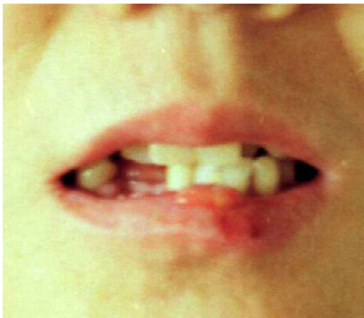
Two teeth knocked out