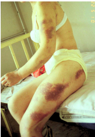
Picture taken 9 days after rape

Female Falun Gong practitioners have been stripped, body searched, and beaten with electric batons in public. They have had their breasts punctured with iron wire. Eggplants, toothbrushes, water bottles, and hot pepper powder have been forced into their vaginas, in addition to electric batons. The police also torture practitioners' children and force pregnant practitioners to have abortions. They try to destroy them mentally and spiritually.